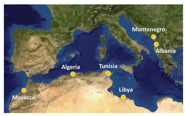
The project is being implemented in 6 countries - Albania, Algeria, Libya, Montenegro, Morocco and Tunisia.