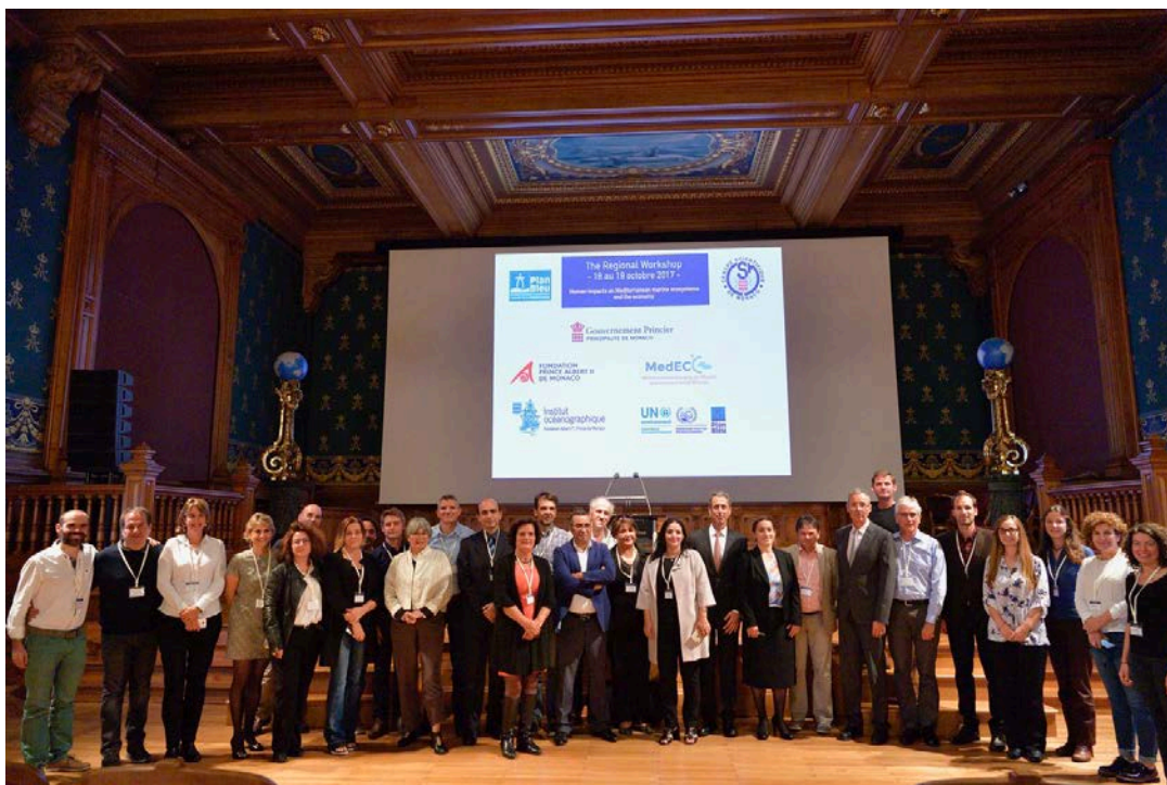
Participants of the regional Workshop on "Human impacts on Mediterranean marine ecosystems and the economy", Musée océanographique de Monaco, 17-18 October 2017

This document analyses the main threats, vulnerability and ecological and human impacts. On the consensus of a wide range of specialists in different disciplines then some responses and policy options as well as main knowledge gaps and needs are proposed as conclusions for Mediterranean decision makers.