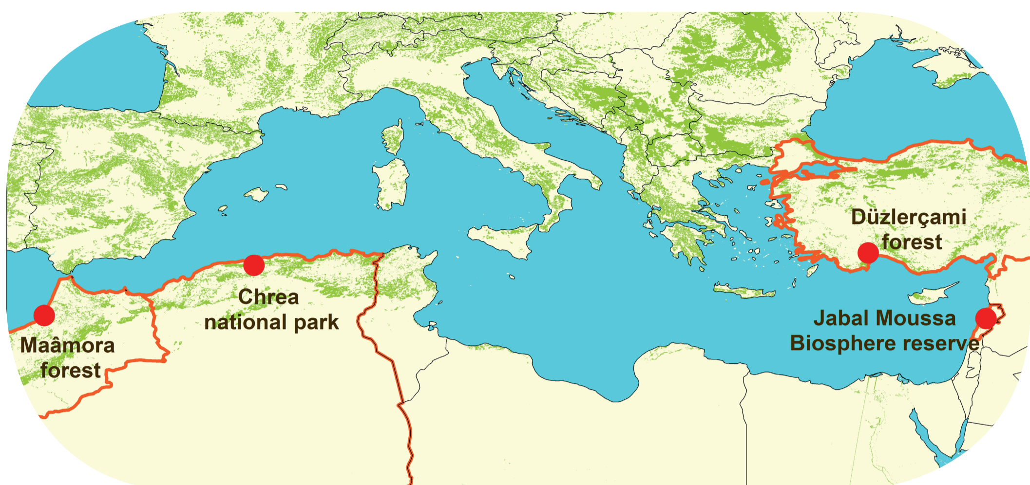
Pilot sites of the project funded by the FGEF

Growth of population with 95% in south-eastern Mediterranean countries