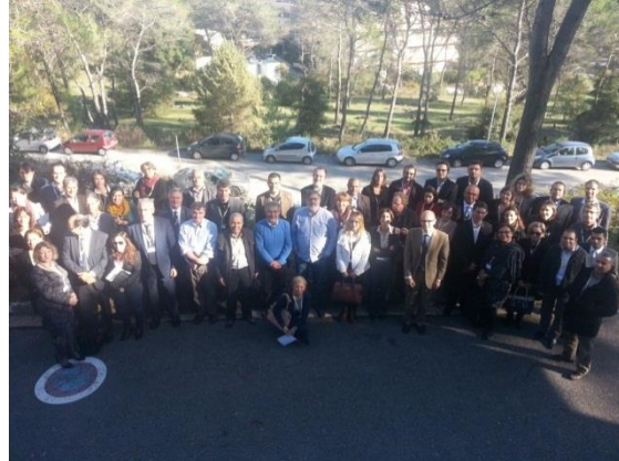
Photo 1: Group photo – Consultation workshops, Sophia-Antipolis, France, 20th November 2014.

Gathering more than 60 key stakeholders and experts, a set of Consultation workshops took place on 19-20 November 2014, at the Plan Bleu headquarters (Sophia-Antipolis, France), immediately after the conclusion of the online consultation process. Following a participatory approach consisting of breakout sessions, these consultation workshops were fed thanks to the results of the online consultation. In addition, the thematic expert in charge of theme 6 “Governance” moderated a participatory session with stakeholders who contributed to the previous online consultation.