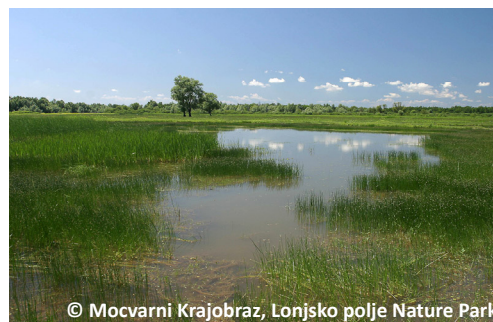
© Mocvarni Krajobraz, Lonjsko polje Nature Park

Plan Bleu (2016). Economic valuation of services provided by Mediterranean wetlands in terms of climate regulation . Plan Bleu, Valbonne.